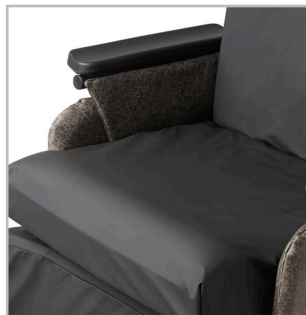
High performance foam covered with removable waterproof cover