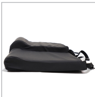
Low profile and unobtrusive cushion