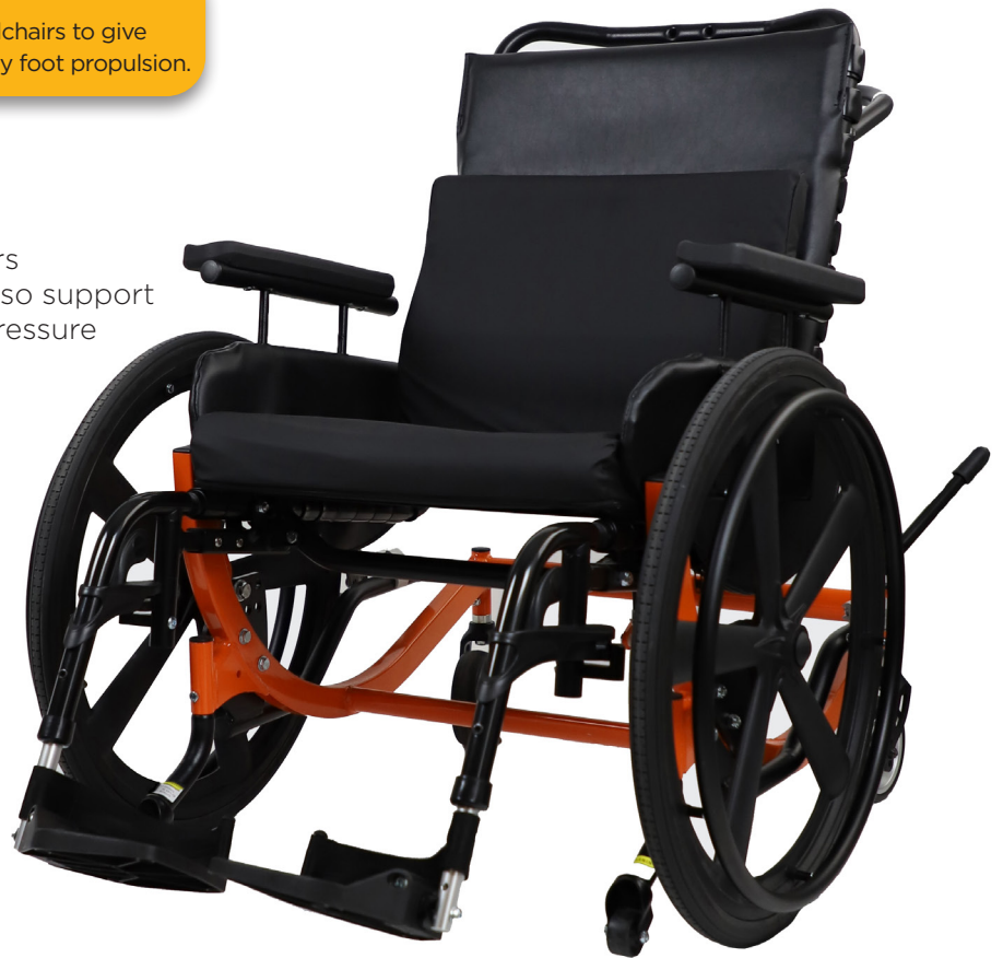
Shown on the Encore Pedal Wheelchair