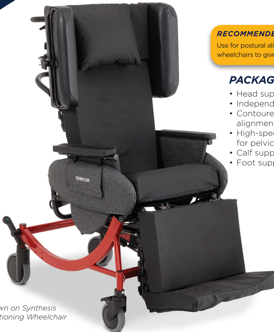
Shown on Synthesis Positioning Wheelchair