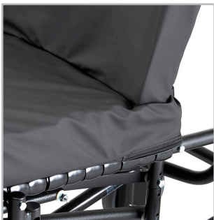
Easy to install and attaches securely to chair