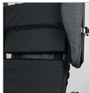
Works in harmony with Comfort Tension Seating ®