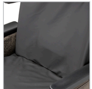
Enhanced body centering, safety, and pressure redistribution