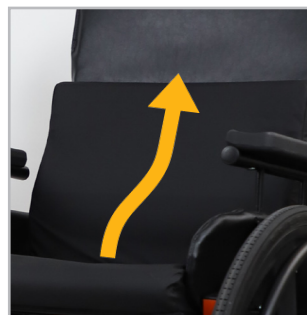
Lumbar support for spinal alignment and improved posture